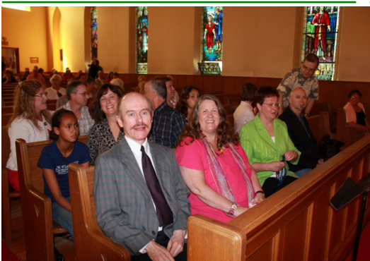
Staff Appreciation Sunday—2012