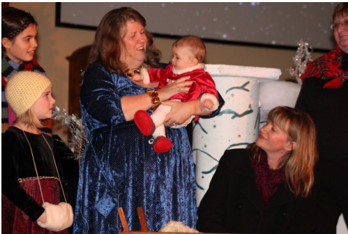
Living Christmas Gift—2012