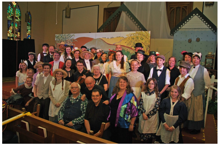
Anne of Green Gables 2015