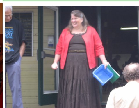
Sparrow Lake 2009