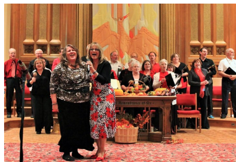
Jazz Sunday 2010