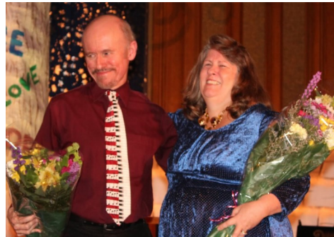
Living Christmas Gift—2012