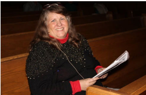
Living Christmas Gift Director 2012